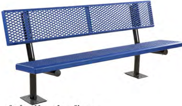
Surface Mount Legs Shown

Total for four benches with taxes and shipping: $2,434.08